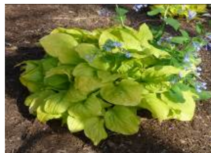
H. 'Strawberry Banana Smoothie'