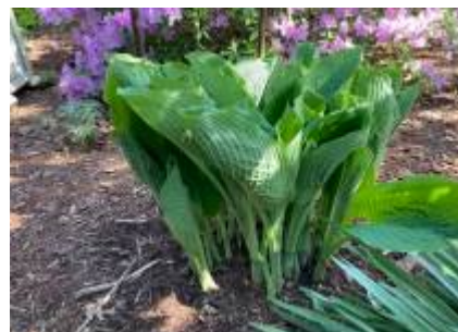
H. 'Viking Ship'