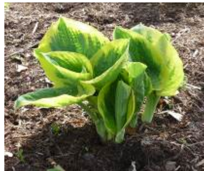
H. 'Mike Shadrack'

Construction is mostly complete at the Missouri Botanical Garden so our sale will return there. Set up is Friday night, May 19, from 5:00 to 10:00 pm. There will be a drop off area on the loading dock on the west end of the new