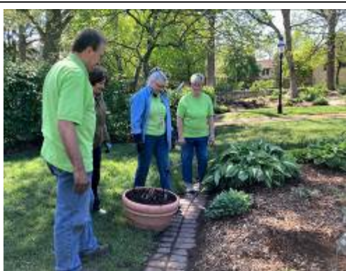
Moving pots to a location with more sun.

We will gather at 8:00 AM, rain or shine, in front of the Missouri Botanical Garden entrance building. Look for people in lime green polo shirts. From there we will proceed to the AHS Display Garden hosta beds located in the northeast section of the Garden. If you arrive after 8:00, catch up with us in the hosta beds. For more information contact Phyllis - pow1031@gmail.com or 314-630-9036.