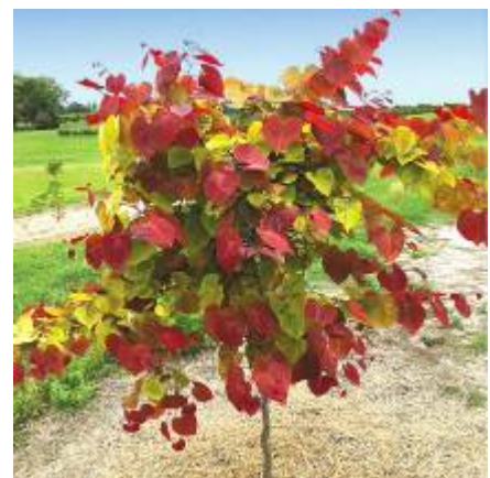
Redbud 'Flame Thrower'