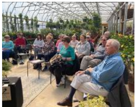
Members listen and learn