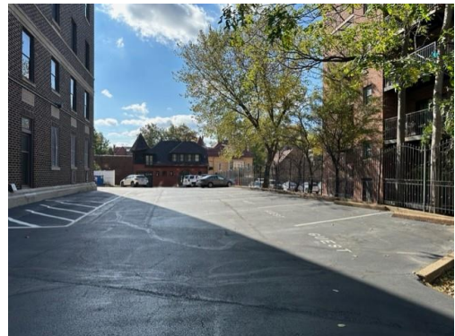
Parking next to the Adlon or on Russell Boulevard

May your stuffing be tasty May your turkey plump May your potatoes and gravy Have nary a lump. May your yams be delicious And your pies take the prize And may your Thanksgiving dinner Stay off your thighs!