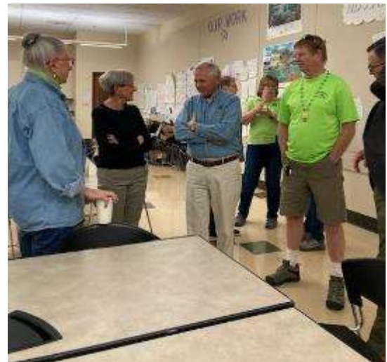
Members stayed around to chat. It was good to see each other again.