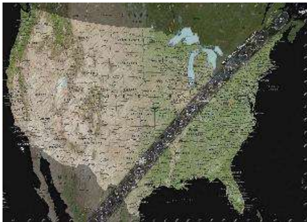
Map of the path of the April 8 total eclipse. Photo from www.science.nasa.gov created by NASA Scientific Visualization Studio

While partial eclipses occur with some regularity, total eclipses are quite rare. The St. Louis area will not experience another for at least 100 years. Let's hope that Mother Nature cooperates and give us a beautiful day without a cloud in sight.