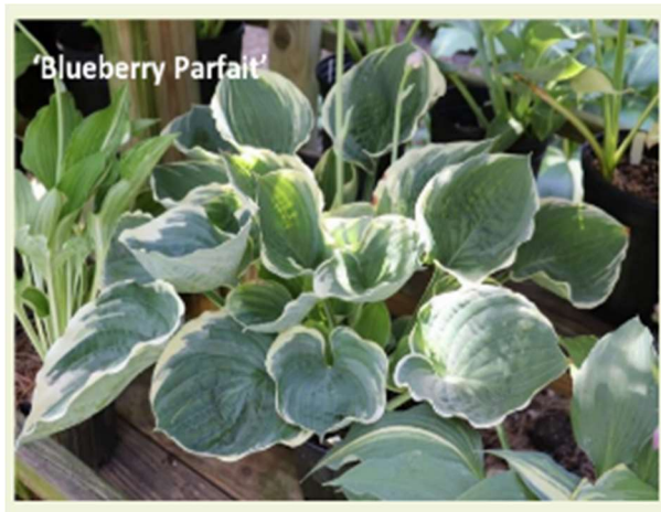
H. 'Blueberry Parfait'