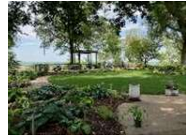
Relax on top of the bluff