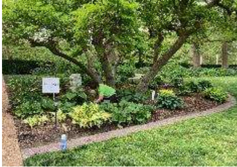
Barb Moreland weeding - 2023