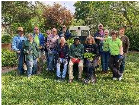
The crew - 2023