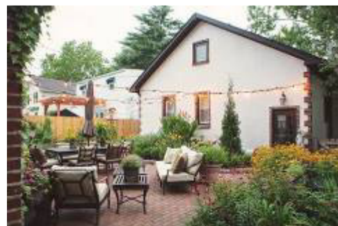
Gene's patio is waiting for the party to begin