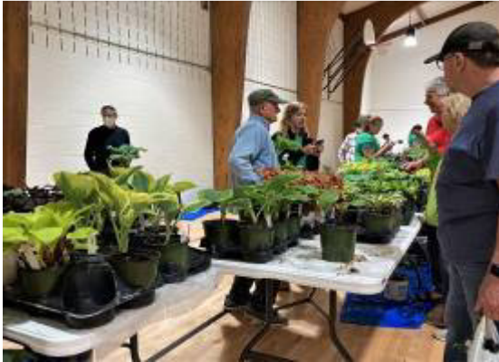
Hostas on the Bluff was a very, very popular shopping venue. People are ready to get their hands in the dirt.