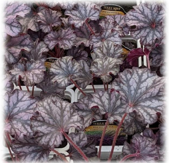
Heuchera 'Forever Purple'