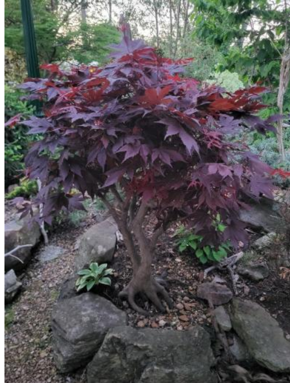
31-year-old Japanese Maple