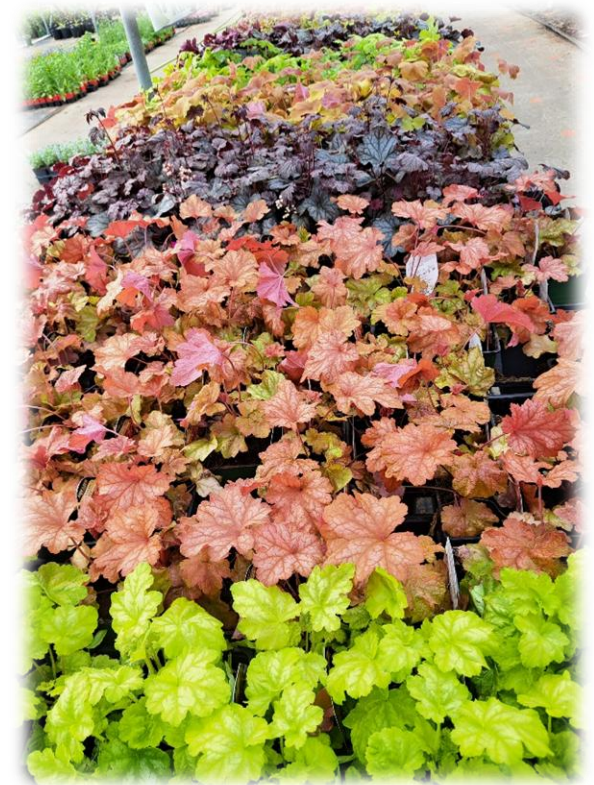
So many choices...