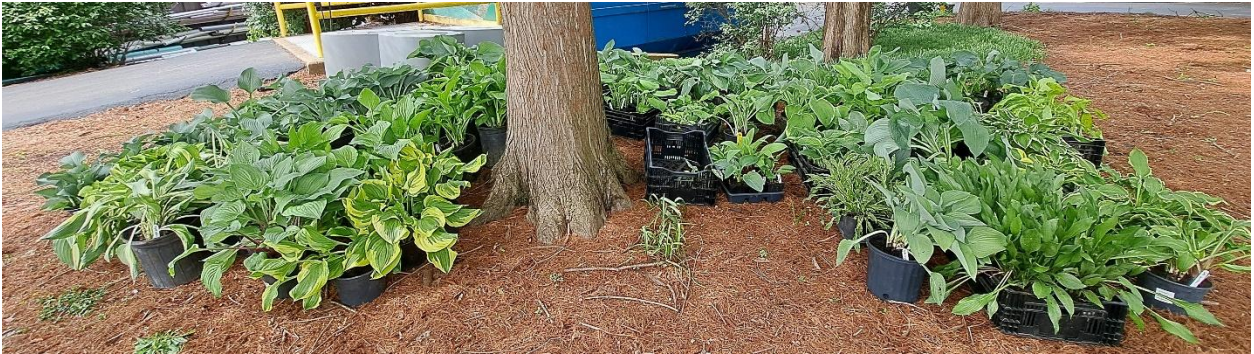
The Fruits of our Labor