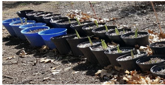
Recently potted Hostas with 3-4 pips per 1 GL pot

It's time now to go out to your garden as your Hostas are breaking dormancy and sending up new shoots and decide which of your favorite clumps you want to divide. The entire clump can be dug and cut in half as the new pips are emerging so you can put the first half of the clump back in your garden to grow on. You can then divide the other half up to put in pots to share with all your friends and family or plant in other areas in your garden with partial shade. Gifted plants (and even sometimes in plants bought at Garden Centers or Nurseries) can contain invasives unknowingly in the soil. Therefore, I suggest you rinse all the soil off the clump you are dividing to help eliminate any pests that may be present (especially any invasives such as jumping worms or noxious weeds) to help prevent them from being spread to areas that are not yet infested. Be sure to use either new pots or used pots you sterilize to help eliminate disease possibilities (especially HVX Virus). You also need to use new artificial growing mix for potting up divisions for the same reasons.