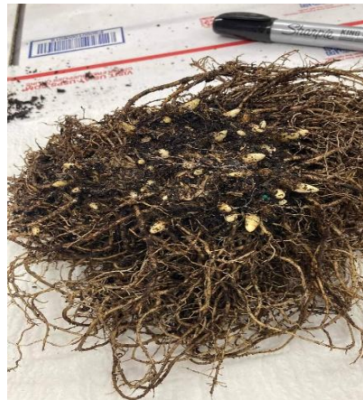
Rinse off soil for easier division