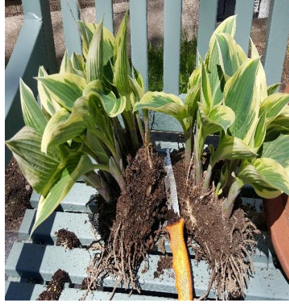
My best serrated knife for dividing