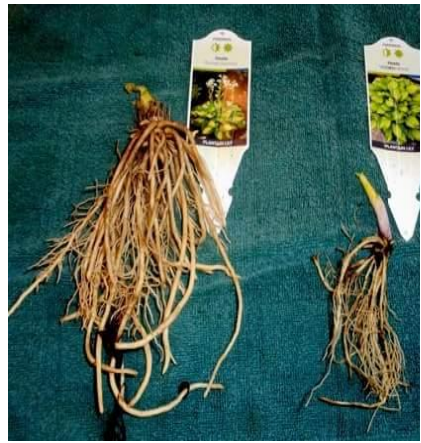
Single divisions ready to plant