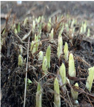
I like to divide down to 3-4 pips

If you have questions or want to learn more about Hostas, I suggest you join the Upstate New York Hosta Society. They currently meet with other members of the Capital District Garden Alliance at the Cornell Cooperative Extension of Albany County Office on the third Saturday of the month. Don't hesitate to send an email to the Upstate New York Hosta Society at: UNYHS@aol.com for detailed information or to ask your questions about growing Hostas.