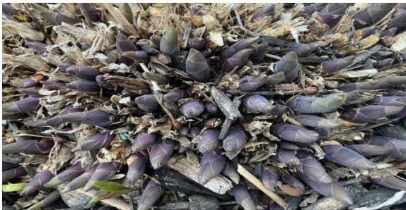
Pips at their perfect size to be dug and divided

This time of year, we get lots of questions on dividing well established clumps of Hostas. Most people feel a Hosta never really needs to be divided if it's growing well where it is. They just like to sit back and enjoy it getting bigger and more beautiful each year. However, if you need to move some (for whatever reason) or just want to share them with friends, it won't be long before our Hostas will be poking their pips out the ground and be ready to be dug and divided if they aren't ready to do so yet. Most years the best time for this in our area is in mid-April but with all the warmer than average temperatures we had in mid-March you should plan to do it a little earlier this year in the warmer parts of our region.