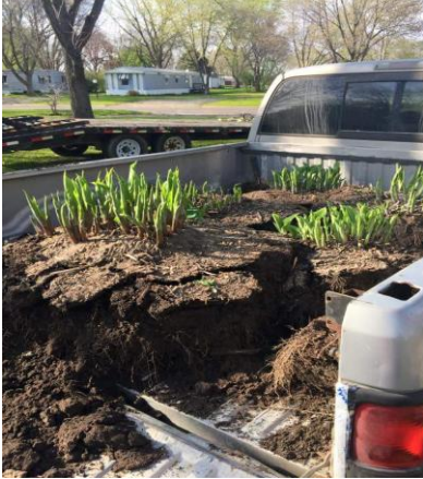
Look at the size of these clumps