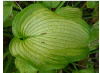
H. 'Lakeside Symphony'