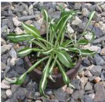
H. 'Manzo'