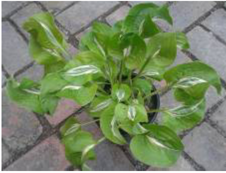
H. 'Royal Tiara'