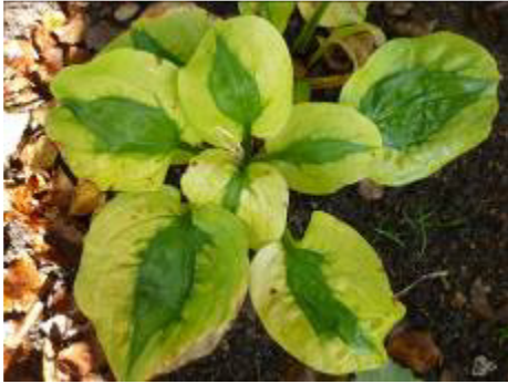
H. 'Stitch in Time'