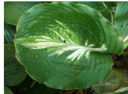
H. 'Lakeside Paisley Print'