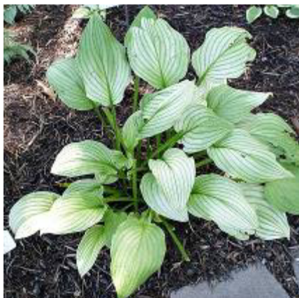
H. 'Zebra Stripes'

H. 'Royal Tiara' is another twisty, contorted plant. The attractive, in my opinion, and uniquely curling leaves have white centers with a green margin. The center often has a darker green color streaking through it. In spite of its strange growth habit, 'Royal Tiara' is vigorous and will add a flair to a container or to one of your beds.