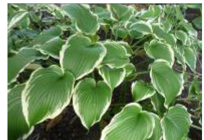
H. 'Lakeside Cindy Cee'