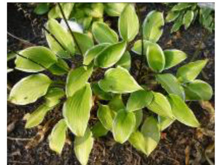
H. 'Lakeside Zesty Zeno'