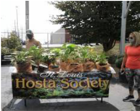
Plants await the mini auction