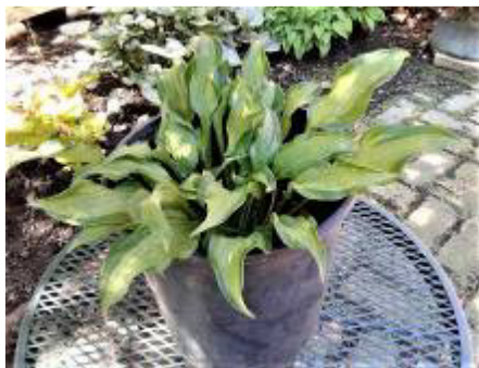
H. 'Allegan Fog'