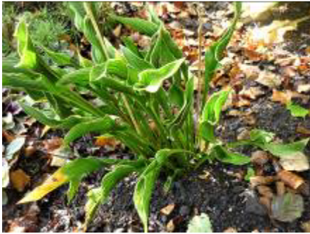
H. 'Praying Hands'