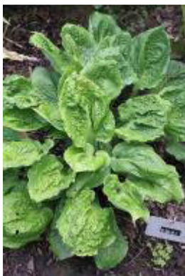
H. 'Road Rage'

Have you or someone visiting your garden stopped in their tracks staring at a plant at their feet. What is that? Is that really a hosta?