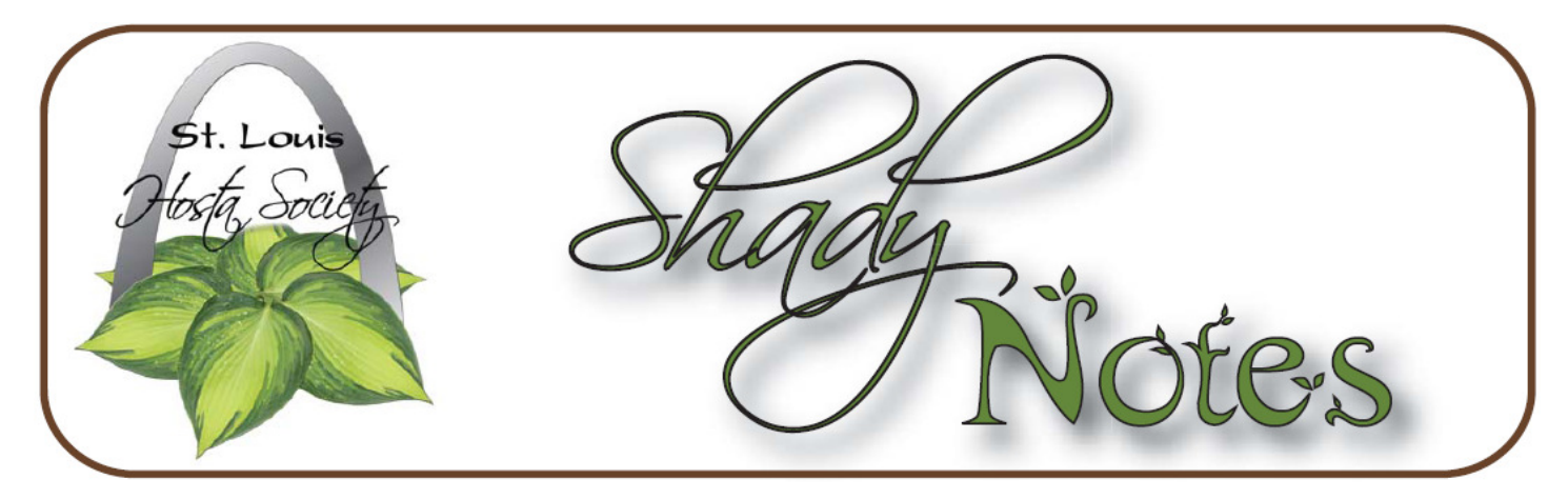
Volume 18, Issue 9