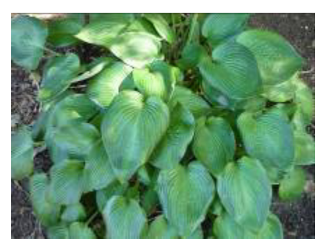
H. 'June' photo taken Oct 25 at MoBot