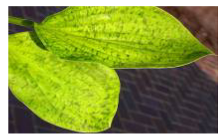
Hosta Virus X