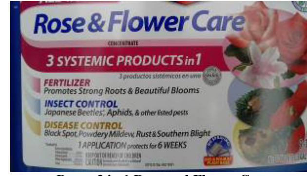
Bayer 3 in 1 Rose and Flower Care or Bayer Disease Control

(Hosta photos from the Missouri Botanical Garden website.)