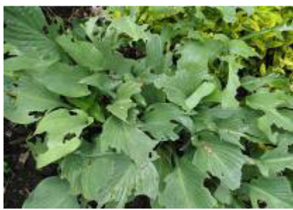
What's eating my hostas!