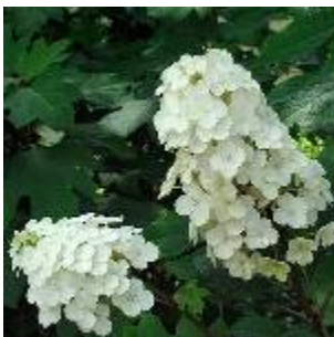
quercifolia - 'Alice'