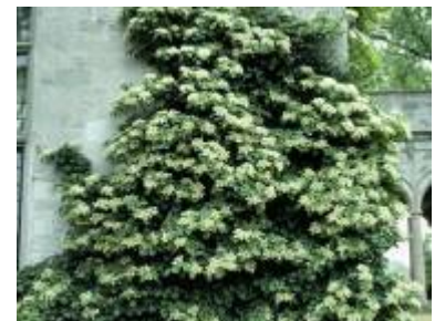
anomola petiolaria - climbing

At our October meeting, Master Gardener Anne Kirkpatrick introduced us to the five types of hydrangea that grow well and are readily available in the St. Louis area. These range from the native arboreascens, your grandmother's hydrangea, to the delicate lacecaps (macrophylla and serrata), the ponderous panicles (paniculata), the woody oakleaves (quercifolia) and the sturdy late blooming climber.