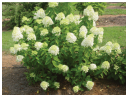
paniculata - 'Limelight'