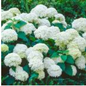
arboreascens - 'Annabelle'