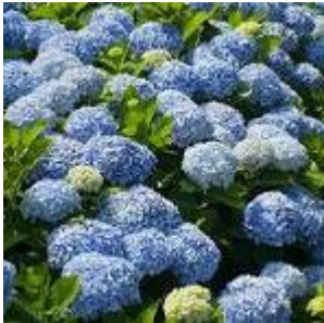
macrophylla - 'Nikko Blue'