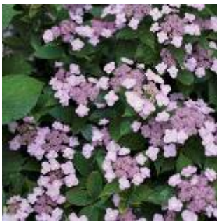
serrata - 'Tiny Tuff Stuff'