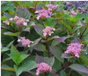
macrophylla – 'Lady in Red'