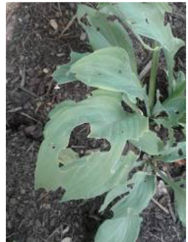
Mutilated leaves of H. 'Regalia'