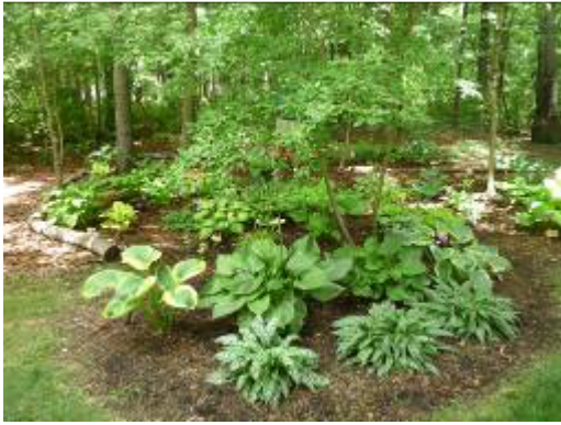
Hostas at home in the woods behind the Birenbaum home.