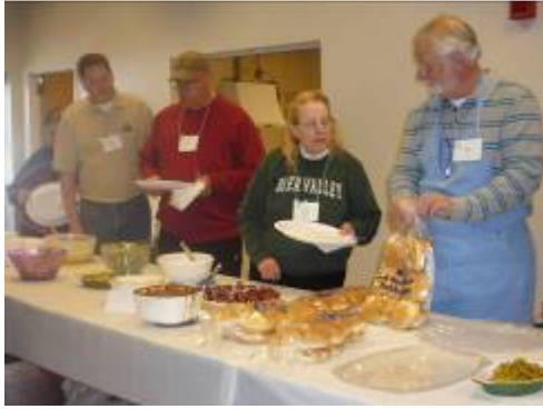
At the 2014 Potluck, members queue for lunch.