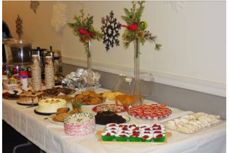
Members were asked to bring a small sharable dessert. They did not disappoint. The table groaned under plates of cakes and festively decorated cookies. Our sweet tooth was satisfied!