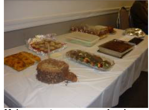
Make sure to save room for dessert! 2014 Potluck dessert table

The gardening magazines have started to arrive. It's official – the gardening season has begun! It's time to shrug off the cold