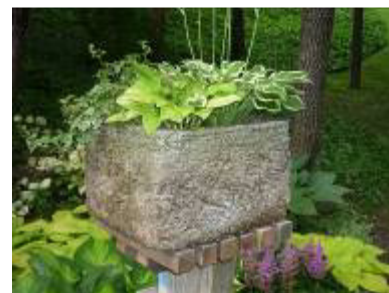
Arlie Tempel garden

Hypertufa is a mix of Portland cement, peat moss and vermiculite, which when it's dry, looks like weathered, crumbly stone. You'll need a trough-shaped mold, such as a plastic dishpan or a heavy cardboard box, to work with. Wear rubber gloves to protect your hands and a dust mask to prevent particle inhalation.