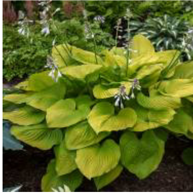
H. 'Age of Gold'