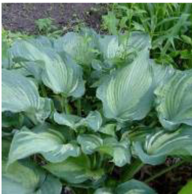
H. 'Guardian Angel'