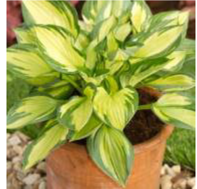
H. 'Colored Hulk'