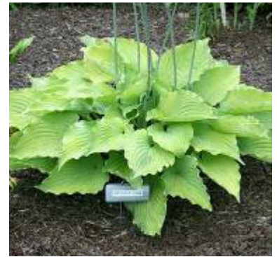
H. 'Grecian Vase'