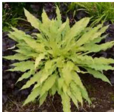
H. 'Wiggles and Squiggles'