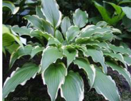
H. 'Louie Louie'