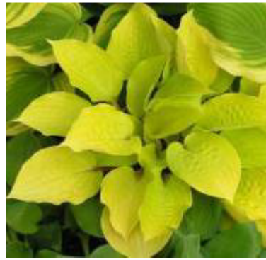
H. 'Fire Island'