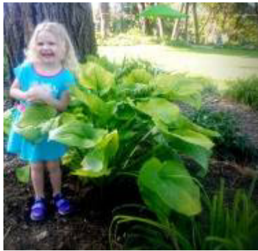
H. 'Emma Rose'