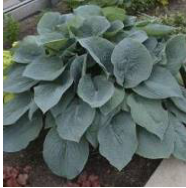
H. 'Blueberry Muffin'