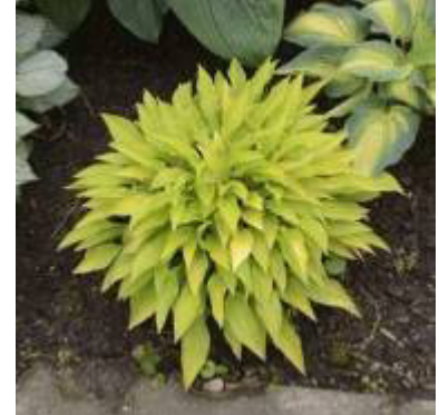
H. 'Munchkin Fire'