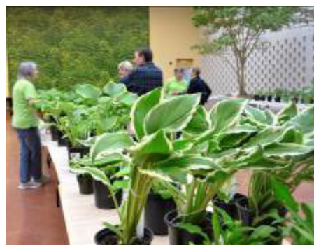
2019 MOBot Hosta Plant Sale