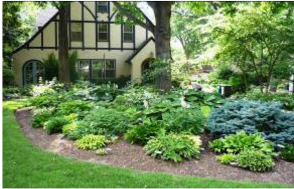
Pat Payton and Jean Hudson use crisp lines to delineate their beds. This is time consuming work but adds elegance and flow.

Now is the perfect time to take stock of your garden. Grab a cup of coffee or tea and walk through your private space. It's spring! The hostas are emerging, fern fiddleheads are unfurling, and the azaleas, crabs and cherries are in full bloom. Perfect! But is it? Step back and take an overview. Do the edges of your beds need definition – the icing on your cake.