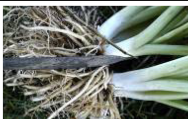
If you can't pull the divisions apart, use a knife to cut the crown. Be careful not to cut too many roots.