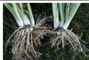
Result is two nice divisions each with plenty of roots – ready to replant.