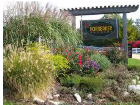
Hornbaker Gardens Nursery