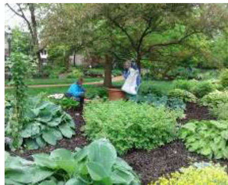
2019 MOBot Work Day

At the moment Hornbaker Gardens is closed and is not accepting reservations for this special event. Large gatherings might not be allowed or advisable even as far in the future as July. Due to all the uncertainty, the Board has decided to cancel this trip.