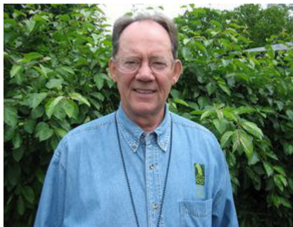
Connie Alwood photo from SLMG.com