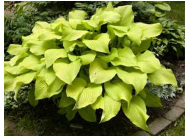
H. 'Sun Power'

'Sum and Substance' 'Leading Lady' 'First Frost' 'Niagara Falls' 'Blue Mouse Ears' 'Sagae' 'June' 'One Man's Treasure' 'Whirlwind' 'Gold Standard'