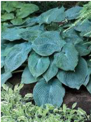
H. 'Blue Angel'