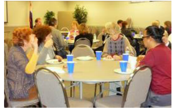
In 2015, members chatted during and after lunch. There's never a lack of delicious food.

Time to get the gardening season off to a great start. Join your fellow hosta lovers for an afternoon of delicious food, lively chatter and talk of upcoming hosta happenings.