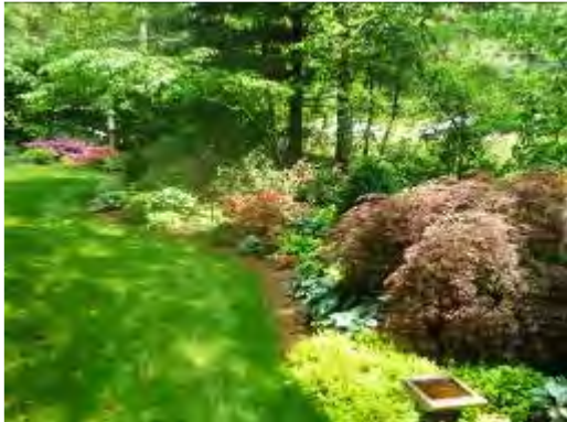
A large Japanese maple cascades over large blue hostas along Martha's shady border. Golden Creeping Jenny provides contrast.

The day was typical St. Louis – hot and humid. But the hostas were unfazed, displaying all those bright hues – the fresh golds, greens and blues of May.