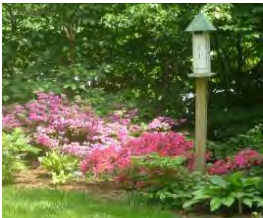
A butterfly house towers over a vivid backdrop of lavender and pink azaleas.