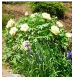
Intersectional peony Bratzella