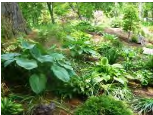
H. 'Blue Angel' anchors the newly cleared hillside. In another year, this bed will fill in beautifully.